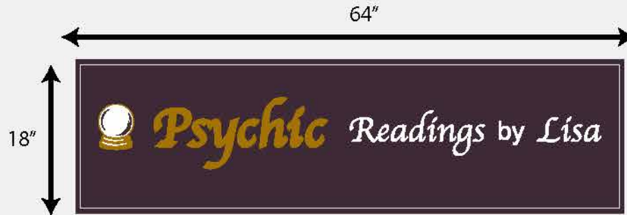
Single Sided Sign

Hanging Sign Psychic Readings by Lisa HDU (material) Thickness: 2" Width: 64" Height: 18" Dimensional Routed Letters: .5" depth Dimensional Image: .5" depth Raised Edge: .5" depth