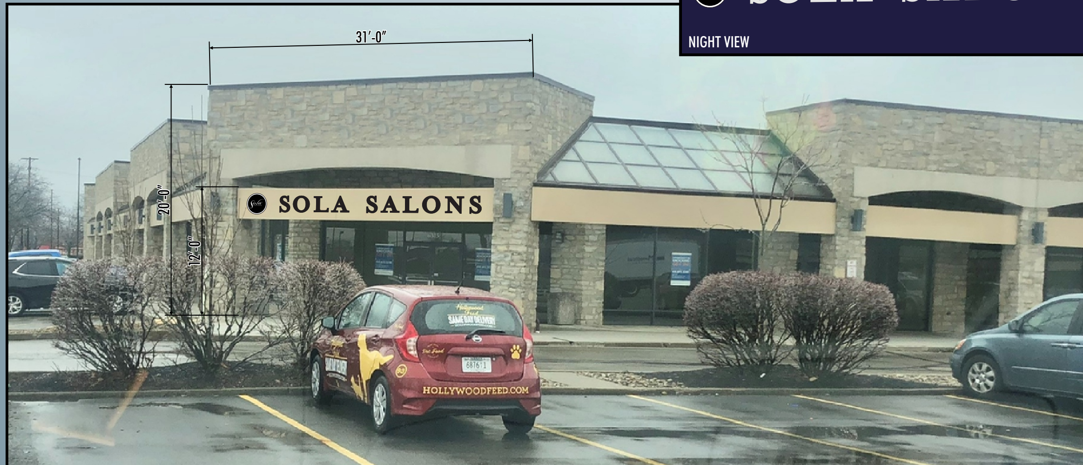
PROPOSED CONCEPTUAL: SCALE: 1/8" = 1'-0"