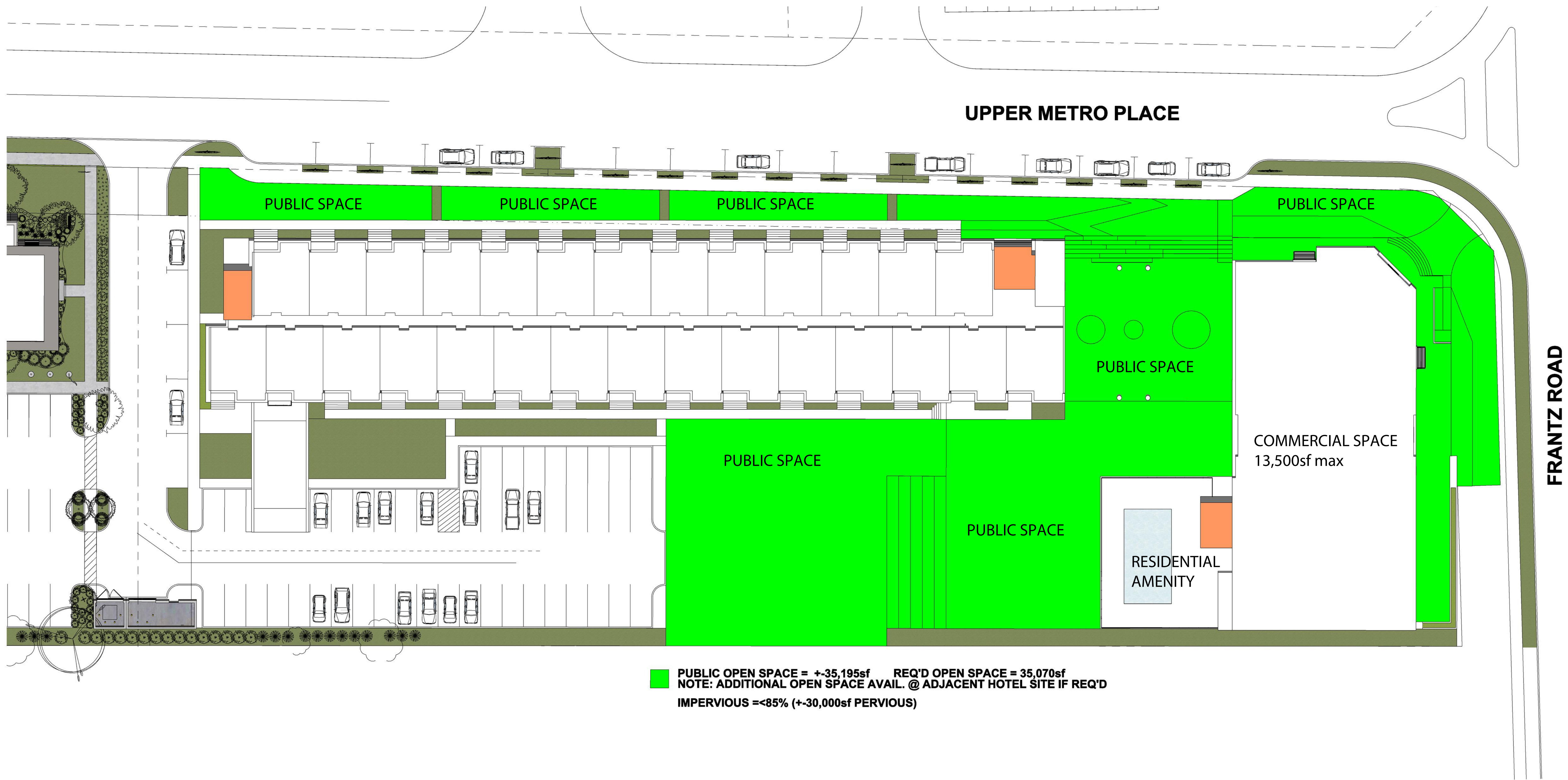
OPEN SPACE DIAGRAM

PRELIMINARY: SQUARE FOOTAGE AND CONFIGURATIONS ARE SUBJECT TO CHANGE AS PLANS AND DESIGN DEVELOP.