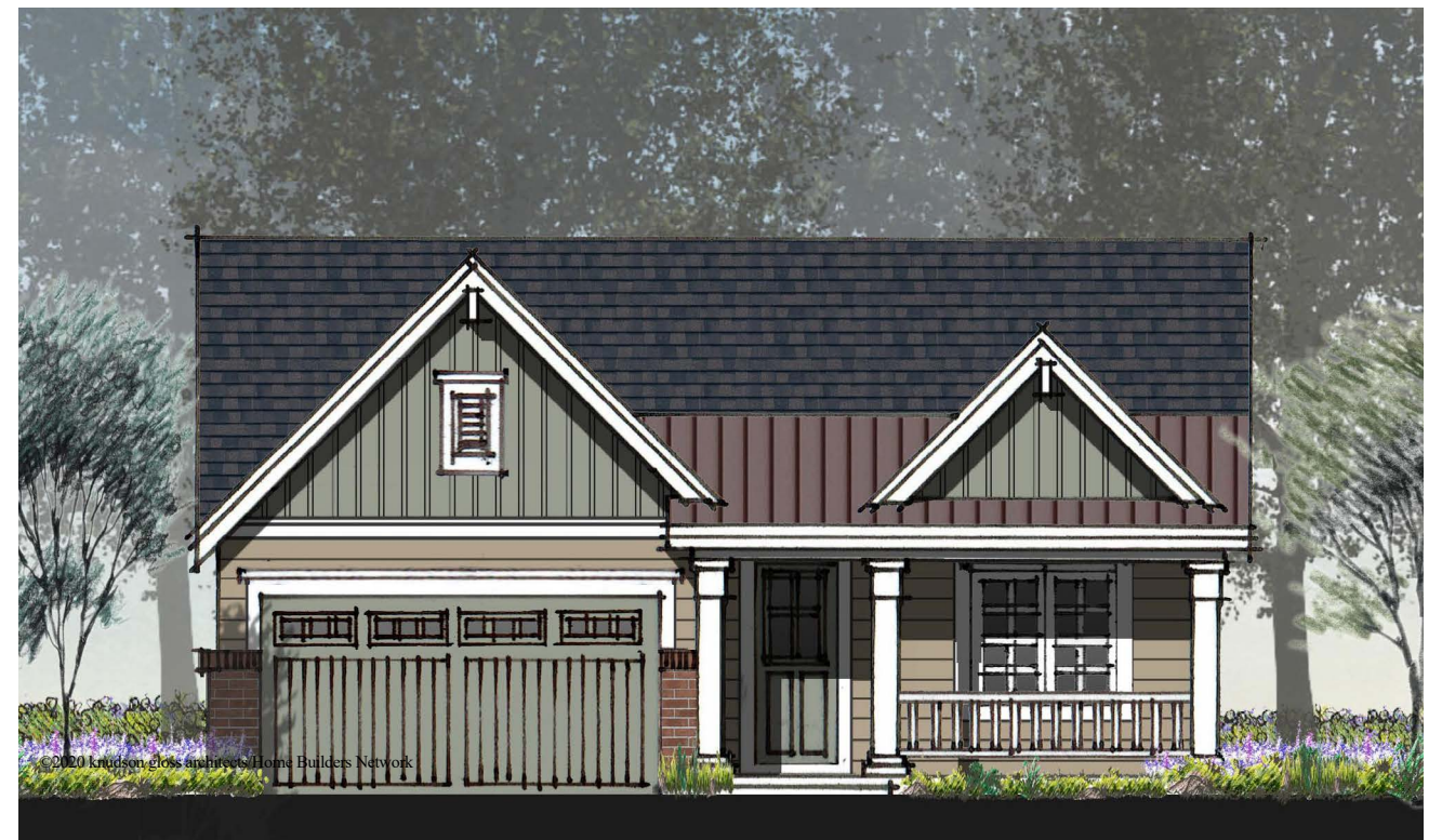
TRADITIONAL COTTAGE ELEVATION