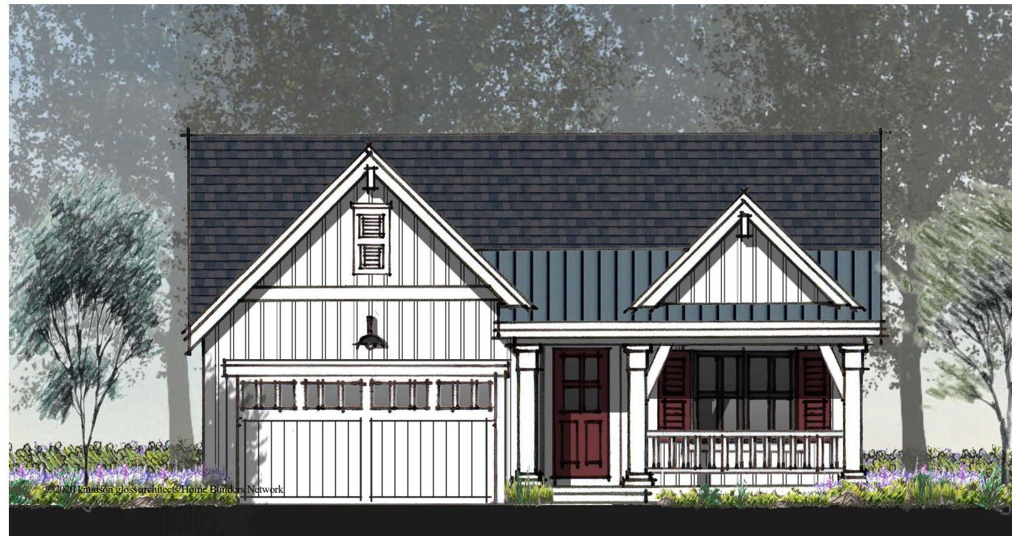
MODERN FARMHOUSE ELEVATION

*Elevations are Conceptual. They depict character and general elements of the proposed homes.