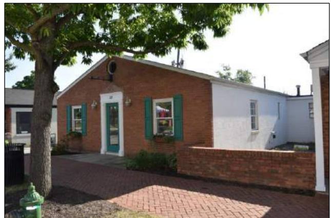
26-28 N High St, looking northeast