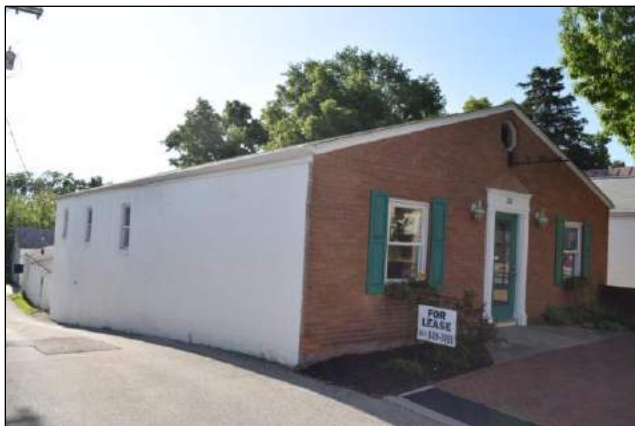
26-28 N High St, looking southeast

District: Yes Local Historic Dublin district Contributing Status: Recommended contributing National Register: Recommended Dublin High Street Historic District, boundary increase Property Name: N/A