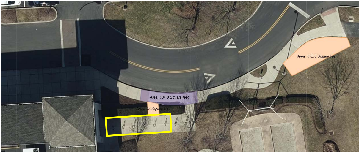
Figure 2. Site showing proposed locations of ADA-compliant curb ramp (purple), relocated bike racks and new sidewalk (light pink) and shelter (yellow).– DCRC

The City of Dublin, Division of Transportation and Mobility is hereby requesting a QUOTE from selected, professional engineering consulting firms. The majority of the design professionals involved with the project must be located in Central Ohio. The selected firm will provide the professional engineering services for this project in accordance with the Project Description and scope of services described below. The project construction must be complete no later than July 30, 2022. Acceptance of this request is a commitment by the consultant to adhere to the project construction deadline.