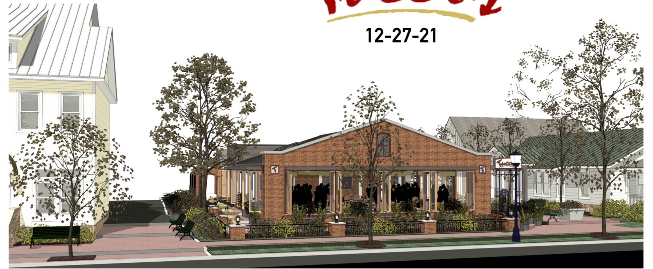
ALTERNATE #2 (Retain Existing Structure)