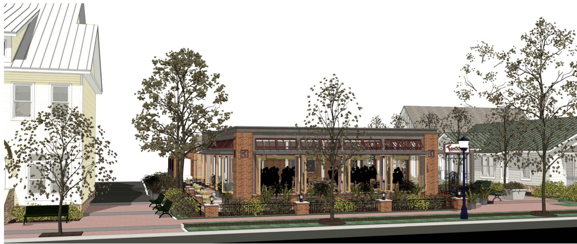
ALTERNATE #1 (New Structure)