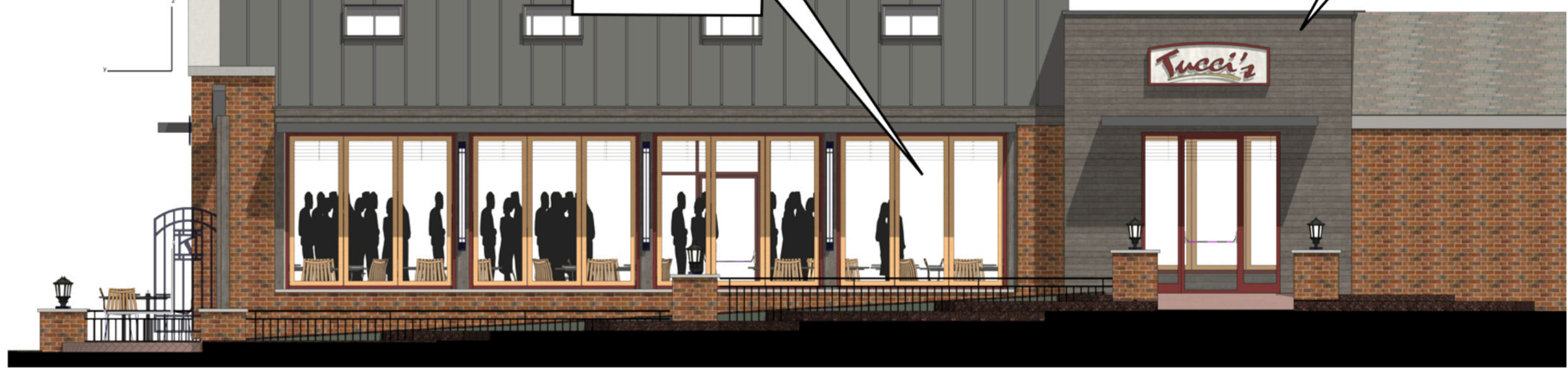
ALTERNATE #2 (Retain Existing Structure)