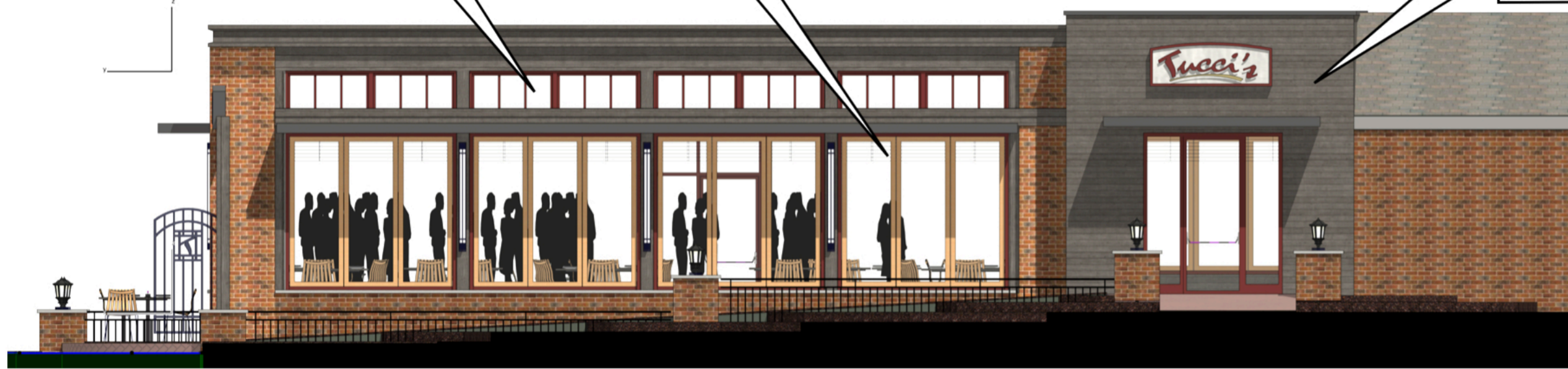
ALTERNATE #1 (New Structure)