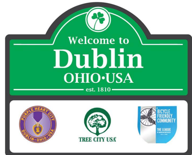
Alternative 3: Lucida Bright Font