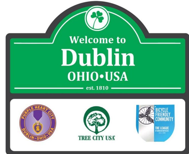
Alternative 1: Cambria Font