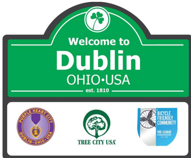
Alternative 2: Tahoma Font