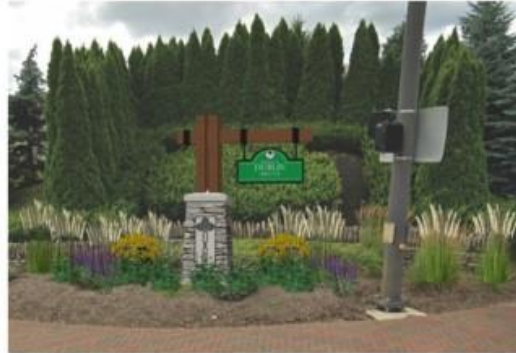
Concept 1: Wood Cantilever