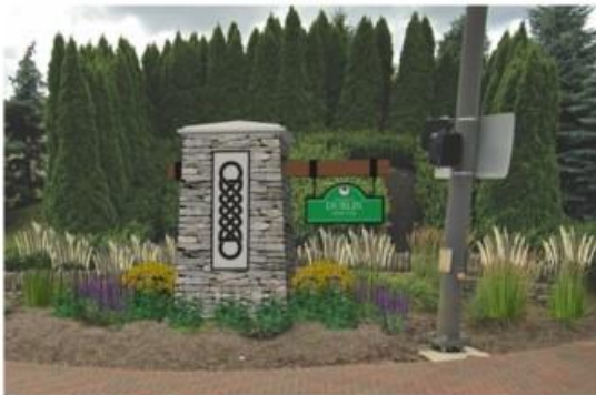
Concept 3: Stone Column – Standard Cap