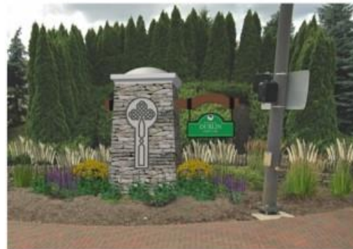
Concept 4: Stone Column – Dome Cap (gray)