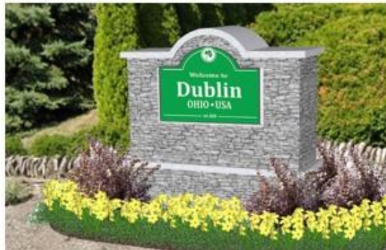
October 11 Proposal