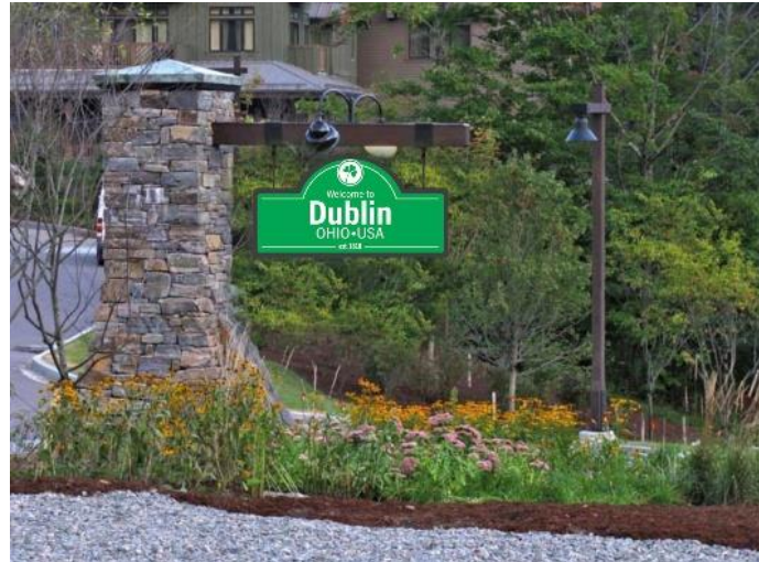
Preferred Monument Sign Style

Based on the CDC's direction, staff has developed five monument sign options for the CDC's consideration (see Appendix B; the options can be viewed in greater detail on the attached presentation). Each option is based on the CDC's preferred style, featuring limestone columns, wood mast arms, and Celtic knot icons. The Celtic knot icons can be switched based on preference for each option. Additionally, Concept 5 illustrates a black background for the Celtic knot icon, which can be substituted in place of the gray background for any of the concepts. Cost estimates for each option are included below. As stated above, a phasing plan can be implemented to spread the cost of installation across multiple budget years if preferred. Further, staff recommends including the selected option as part of the 2023 – 2027 Capital improvements Program.