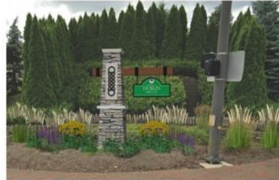
Concept 2: Stacked Stone Column w/ Wood Cantilever