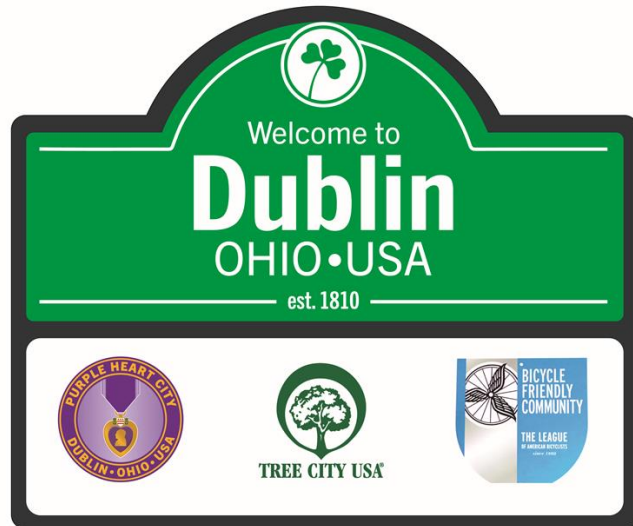
Myriad Pro Font- October 11 Proposal