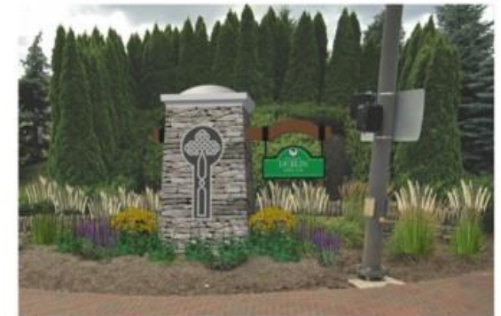
Concept 5: Stone Column – Dome Cap (black)