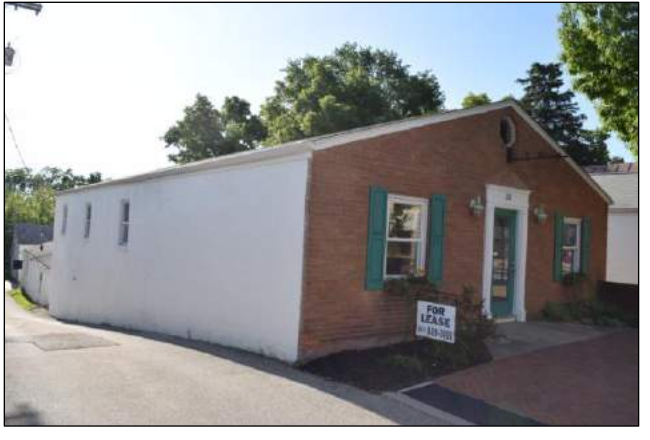
26-28 N High St, looking southeast