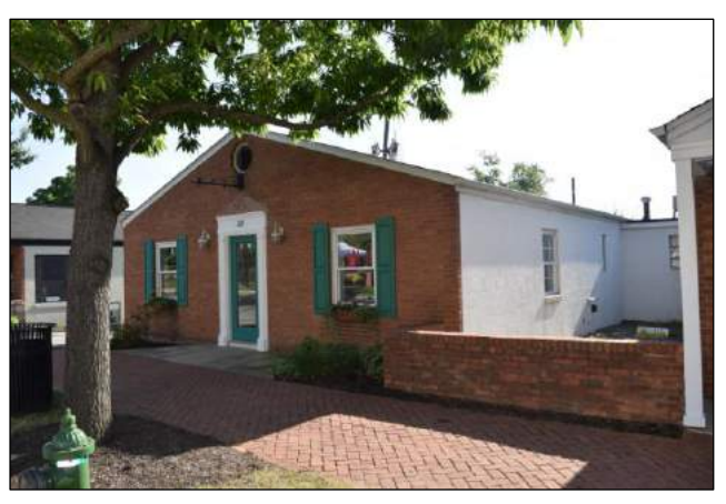
26-28 N High St, looking northeast