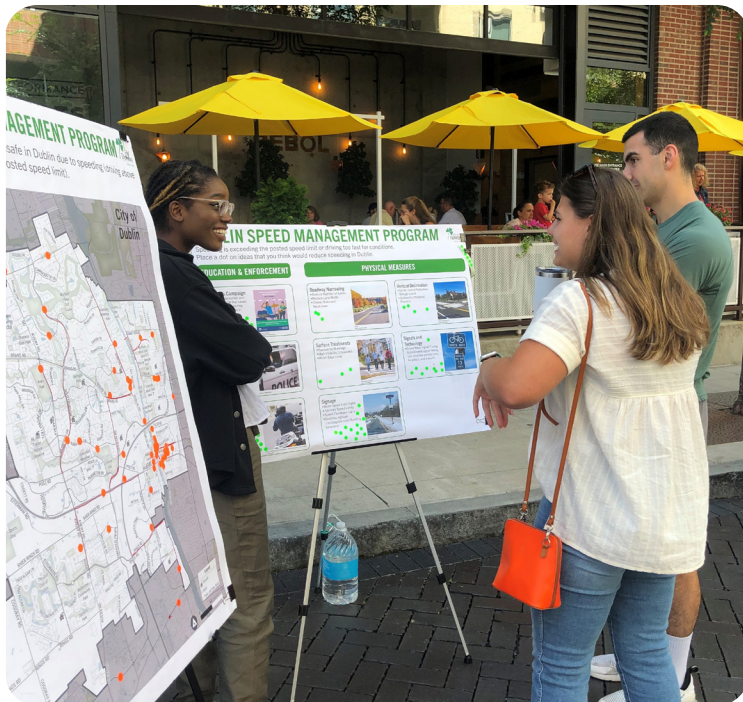
Pop-up engagement event at Dublin Market